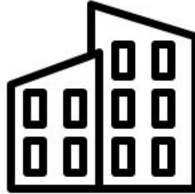
Avesta Specialty Site